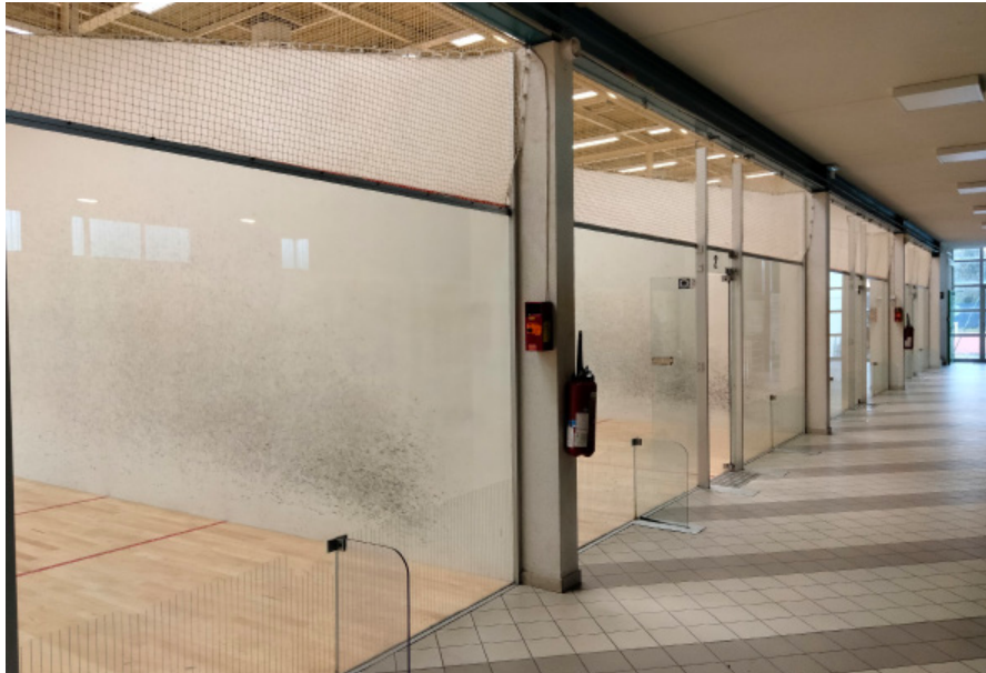
Courts de squash