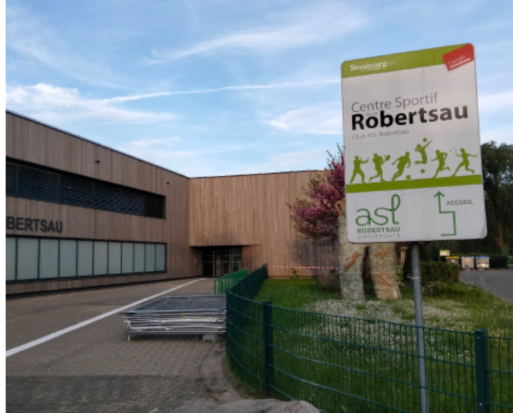
Entrée gymnase principal