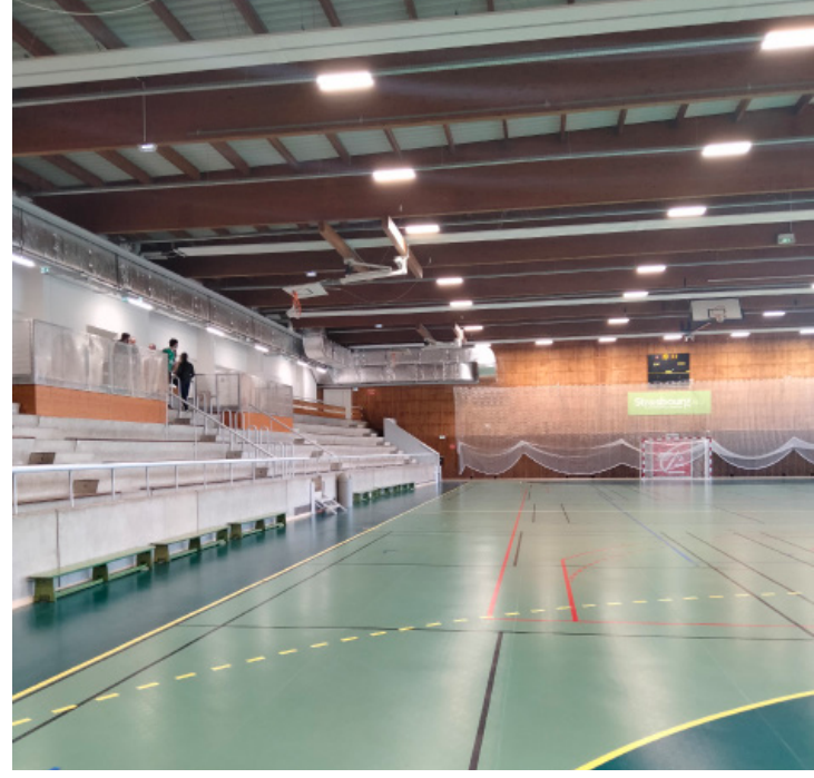
Gymnase pour le tennis de table et le badminton